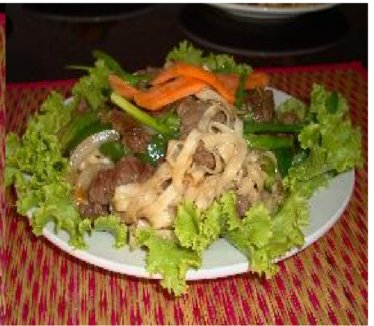
Fried Noodles with Beef