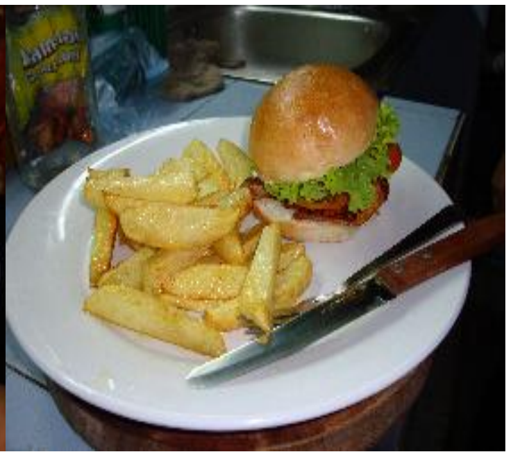
Chicken Fillet Burger & Chips