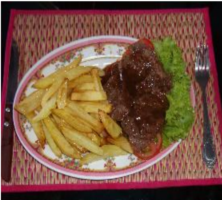
Fillet Steak & Chips