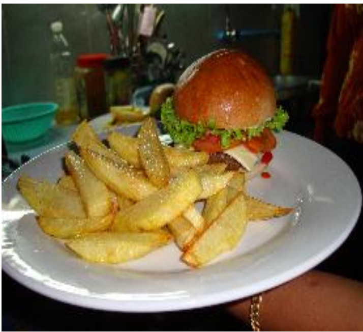
Cheese Burger & Chips