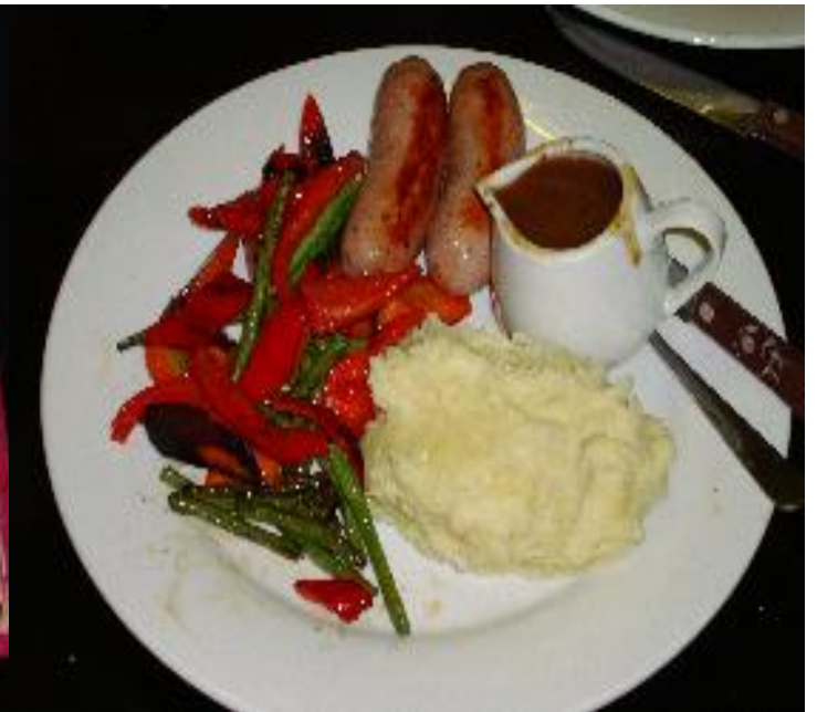
Bangers & Mash