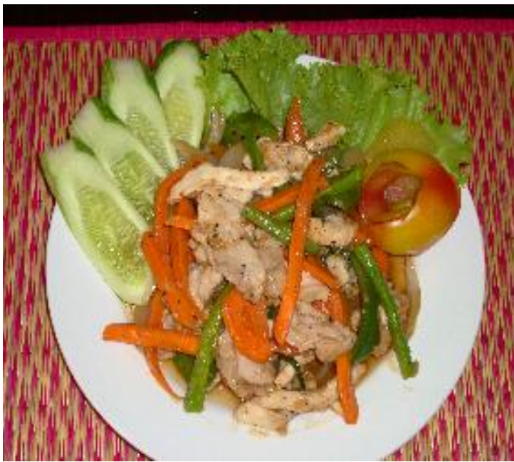
Vegetable Stir-fry with Chicken