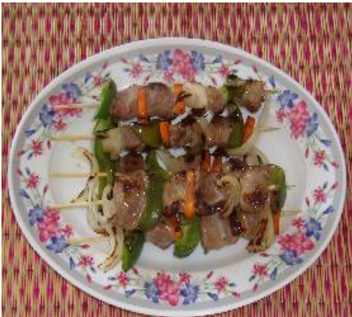
BBQ Beef Kebabs