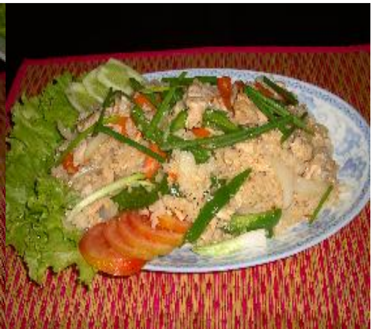
Fried Rice with Chicken