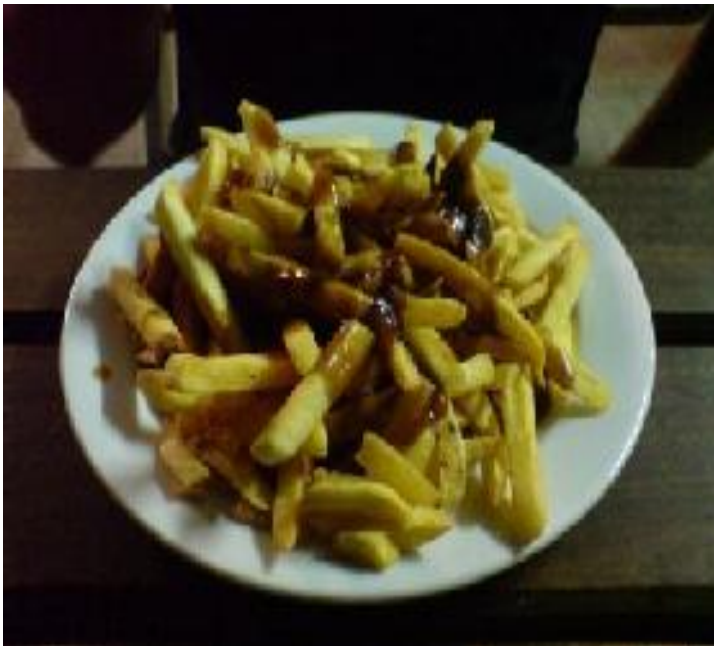
Hot Chips & Gravy