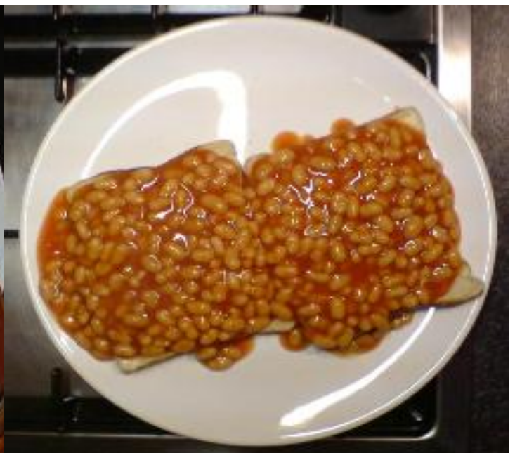
Baked Beans On Toast