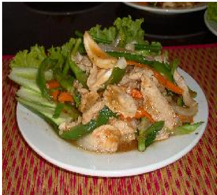
Vegetable Stir-fry with Pork