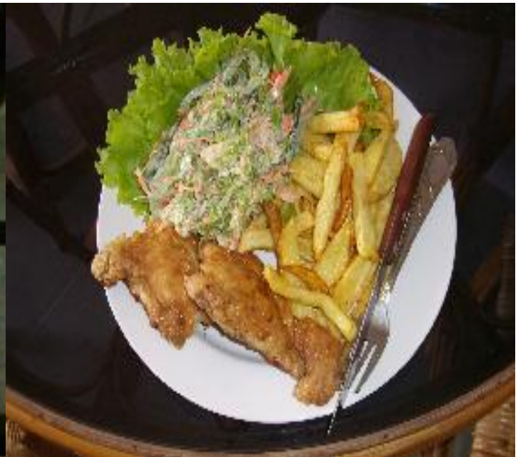
Chicken Schnitzel & Chips