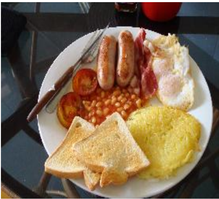
Full English Breakfast